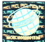
Head of Certification

Certificate Expire Date: 09 May. 2016 2nd Surveillance: Apr. 2015